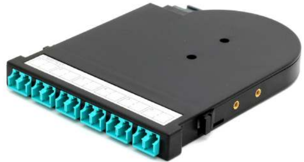
P3Link Xtreme OM3/OM4 Module

Two optical performance options are available. Low-Loss (LL) at 0.75dB maximum/0.50 typical throughput loss across both LC® and MTP connectors, and Xtreme Low-Loss (XLL) at 0.50 dB maximum/0.35 dB typical throughput loss across both LC and MTP Elite connectors for LOMMF OM3/OM4 fibers.