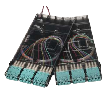
OM4 LC Cassette