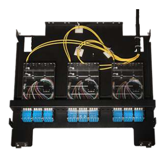
Xtreme+ Trunk Cassettes in 1U Panel