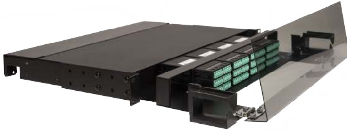
Xtreme8™ 1U Slide Out Panel

Xtreme8™ rack mount patch panels house up to 18 Xtreme8™ cassette modules for a total of 72 duplex ports in a 1 RU space. Xtreme8™ panels come in two designs, a slide out tray version and static panel version.