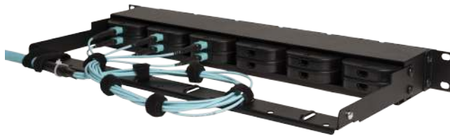
Xtreme8™ Fixed Panel w/rear cable manager

The static version Xtreme8™ 1U panel is completely open for easy front and rear access. It is ideally suited for top of rack (TOR) applications. It can house up to 18 Xtreme8™ modules for up to 72 ports. It can be ordered stand alone or with optional rear trunk cable manager.