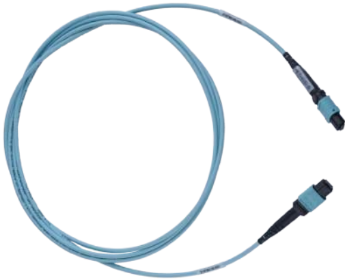
Xtreme8™ MTP® Jumper