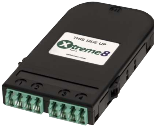
OM3/OM4 Duplex LC to MTP Module